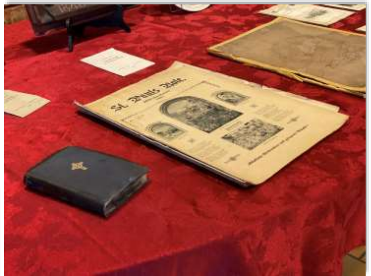
An early edition of the Messenger, Summer 1893 written in German

Back in April, we began a series of weekly "snapshots" depicting moments in the history of our congregation, all under the theme " He who promised is faithful. " (Heb. 10.23) These Anniversary Moments, written by a few FSP members, have been a huge blessing in honoring the history of First Saint Paul's and showing how far we've come in our ministry.