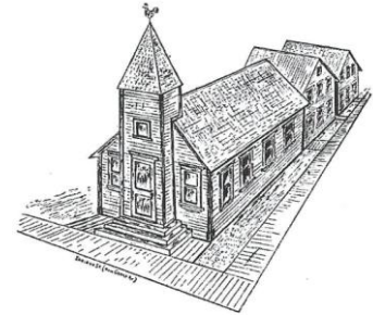
Third House of Worship

One might expect those German Lutherans to have settled in for a long tenure at the new location, but this was not to be the case. The new church served them for only fourteen years before the congregation outgrew the building. A flood of German immigrants fueled the growth. Pastor Wunder reached out to all the new arrivals, offering not only spiritual care but also help with housing, food, and acclimation to Chicago.