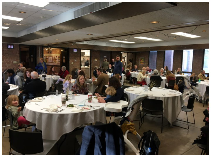
Our Stewardship Luncheon on November 20

Standing on the remnants of fall, Concordia students rest after stringing Christmas lights along our patio fence and around both trees!